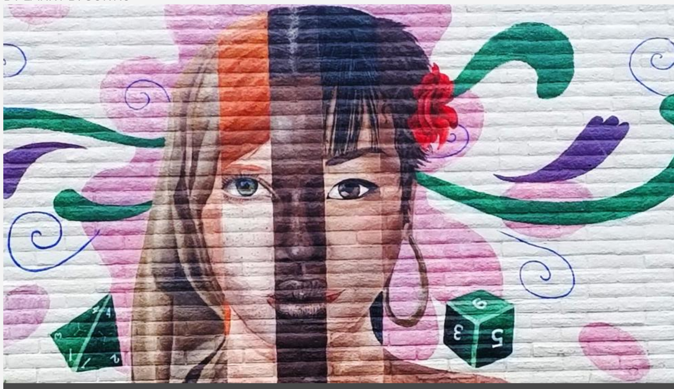
South Salt Lake is home to the second annual Mural Fest, putting wall art up to beautify a neighborhood.

BY LARRY D. CURTIS | WEDNESDAY, MAY 1ST 2019