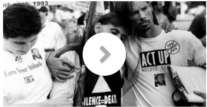
The start of AIDS activism in Utah